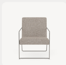
Seamless soft seating chair #937