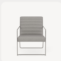
Parallel stitch puffy chair #938

Tariff Surcharge Notice: All Commercial POs received on or after June 1st, 2025 must apply a +5% NET surcharge to the order. See more at viaseating.com/news/tariff-surcharge-june-2025