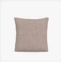
24" x 24" square pillow #P5

Tariff Surcharge Notice: All Commercial POs received on or after June 1st, 2025 must apply a +5% NET surcharge to the order. See more at viaseating.com/news/tariff-surcharge-june-2025