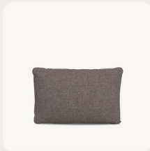
14" x 20" rectangle pillow #P1