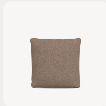
18" x 18" square pillow #P3